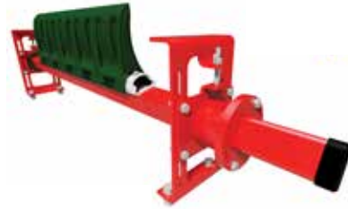
Pulley Belt Scrapers