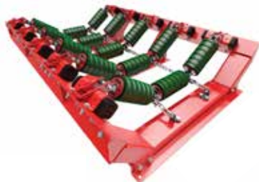
Hi-Impact® Idler System