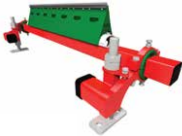
Secondary Belt Scrapers