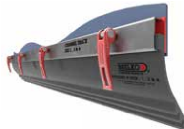
Keyskirt® Chute sealing Systems